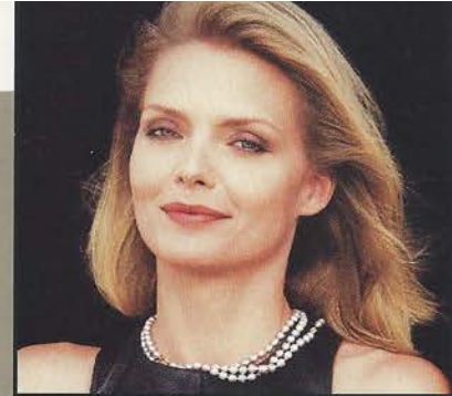
Pfeiffer in One Fine Day

celebrity + Lifestyle + Beauty + Fashion