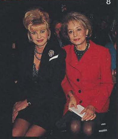
7. Mizrahi, who showed his designs on Halloween, takes a bow. 8. Ivana Trump and Barbara Walters at the Bill Blass show. 9. Actress Kyra Sedgwick views Versus. 10. Susan Sarandon watches the Donna Karan Collection; later she raves, "Karan did a magnificent job. It was modern, original and elegant."