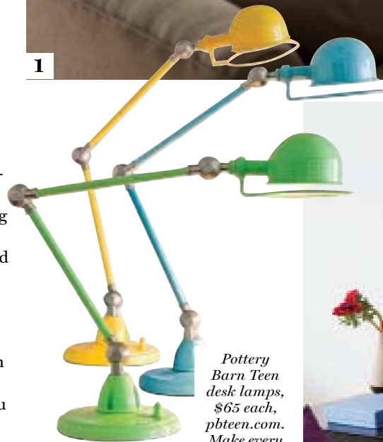
Pottery Barn Teen desk lamps, $65 each, pbteen.com . Make every on-display accessory a stylish one.