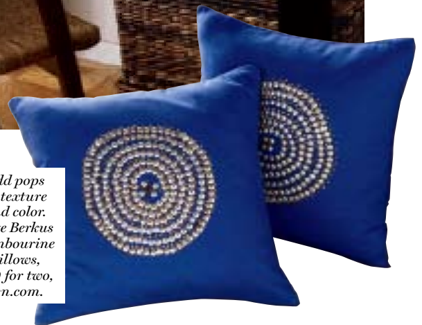
Add pops of texture and color. Nate Berkus Tambourine pillows, $19 for two, hsn.com .