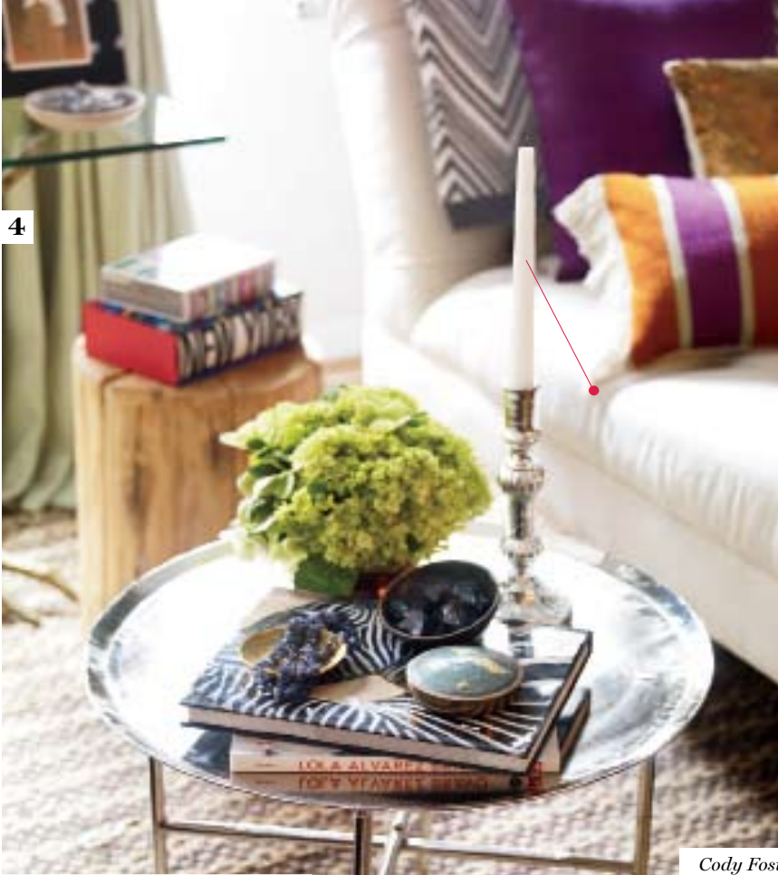
Cody Foster candlesticks, $15 each, 800-595-5907 for store locations