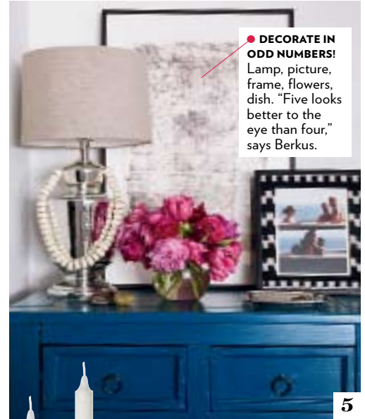
Cody Foster candlesticks, $15 each, 800-595-5907 for store locations

● DECORATE IN ODD NUMBERS! Lamp, picture, frame, flowers, dish. "Five looks better to the eye than four," says Berkus.